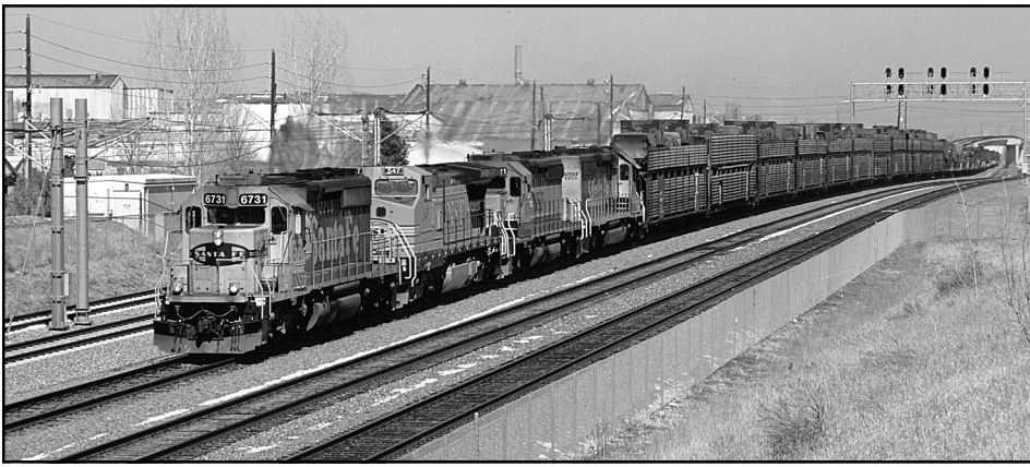
The Army moved three trains via BNSF from Fort Lewis, WA, in mid-March 2002. BNSF SD40-2 6731 led one train through Littleton, CO, on 3/16/02.

Kansas began working at each signal site and continued doing so until the project was finished. All the old D&RGW signals were cut down and the heads of the new signals were lined into position. The line reopened with the new signals at 6:00 PM.