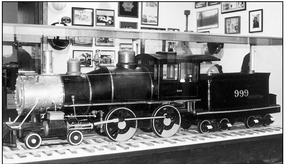
Locomotive 999 now resides in its display case in Edgewater's City Hall.

It was placed on display at the Colorado Railroad Museum, along with seven wooden patterns that Mr. Lindsay used in casting truck pedestals, journal boxes, wheels and other components.