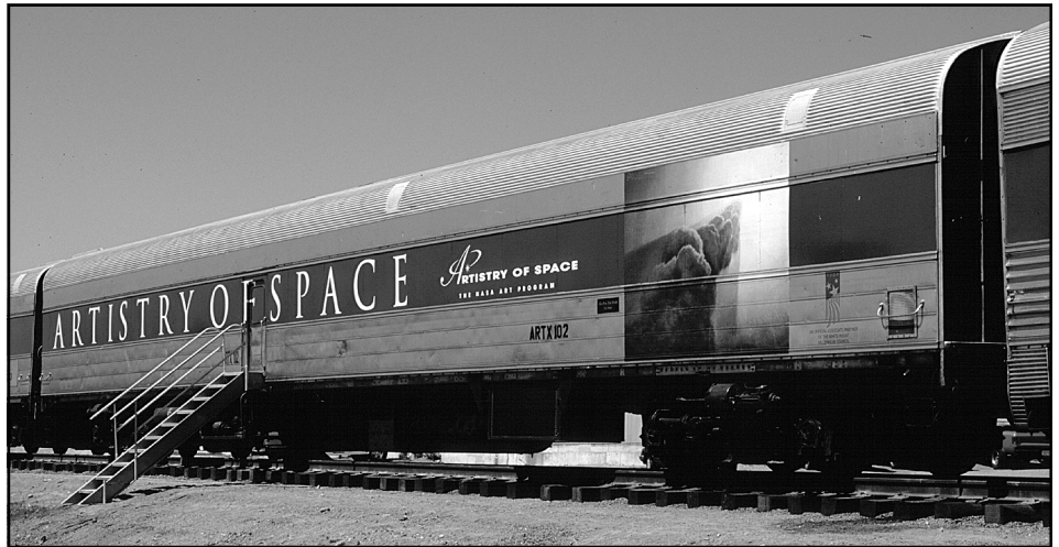
Artrain gallery car ARTX102, an ex-Pennsylvania Railroad twin diner, kitchen car.