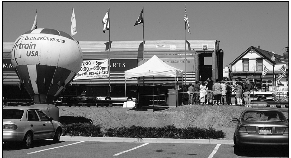
On April 5, 2002, a school group waits to enter Artrain gallery car ARTX101, an ex-New York Central sleeper car, during the train's stop at Olde Town Arvada, CO.