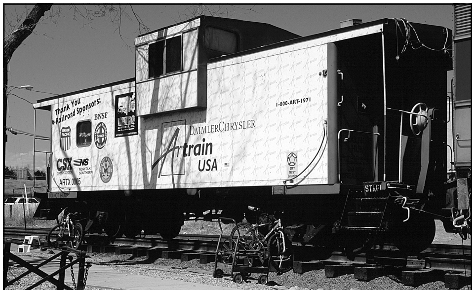
Artrain caboose ARTX0005, informally named the "NASCAR Caboose" due to the number of sponsor's logos. The caboose serves as an office for the Artrain USA onboard staff and as an efficiency apartment for a staff member.